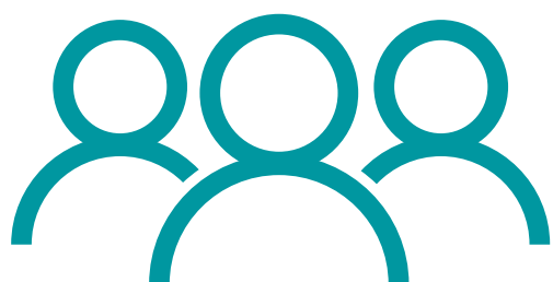
Number of jobs by sector

Adult social care jobs in England: 1.55 million